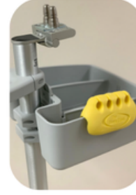
TRAYS & CARTS